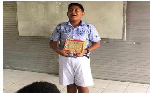
Picture 3. The student presented their work in front of the classroom

[I am so happy to be able to share my ideas to my classmates. I could present my idea well. Even though I had lots of mistakes in presenting my idea, at least I tried!]