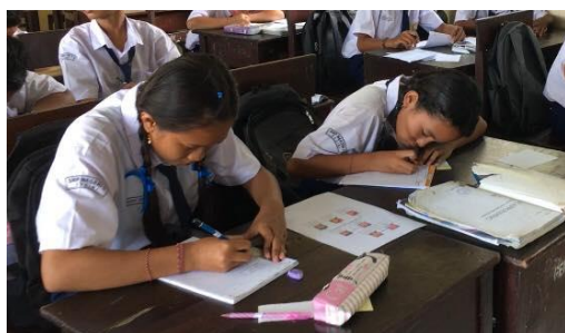
Picture 1. The students focused on making concept of the project

[I felt so excited when this project was given to me. I felt that I was being challenge to search on the best way to complete the project]