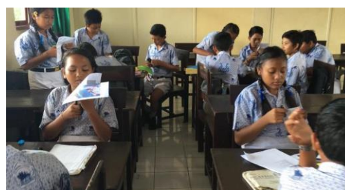
Picture 2. The students enjoyed working on their projects in creative ways.

[I could develop my creative thinking skill while doing these projects. It was so fun! I really enjoyed it!"]