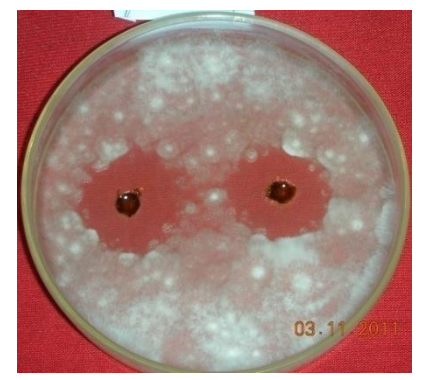
Fig. 4. Activity of inhibitory power of Crude Extract of JeringauRhizome on S. rolfsii on PDA Media after 3 days of incubation

is very strong. So that the jeringau rhizome which has a diameter of inhibitory zone of 26 mm including has a very strong inhibitory power against S. rolfsii fungi. The antifungal activity of the crude extract of jeringaurhizome is shown in Fig. 4. The inhibitory power of the crude extract ofjeringau rhizome in various concentrations is presented in Table 1. The test with diffusion well method showed the Minimum Inhibitory that Concentration (MIC) crude extract of the jeringau rhizome on the growth of S. rolfsii fungi was 0.5% with a barrier zone of 8.70 mm on the third day of incubation.