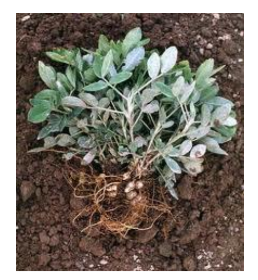
Fig. 1 Peanut Plant

1). Joins or stem segments located in the ground are places attached to roots, flowers, and fruit. The stem segments that are on the ground are where the stems grow. The leaves are oval-shaped, located in pairs (compound), and even-finned. Each leaf stalk consists of four leaflets. Leaf strands are nititropic, which is possible to absorb. The surface of the leaf has a meaning that is as a barrier or storage of dust (Soesanto, 2004).