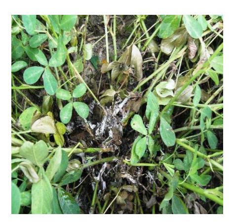
Fig. 2. Peanut Stems Infected with S. rolfsii's Fungu