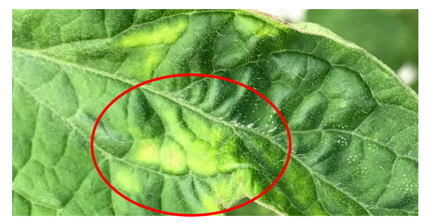
Fig. 1 Symptoms of B. tabaci pest attack

The results of observations on the symptoms of B. tabaci attack can be seen in Figure 1. Symptoms of B. tabaci attack on tomato plants are necrotic and chlorosis spots on the leaves, caused by damage to leaf cells and tissues due to attack by nymphs and adult insects.