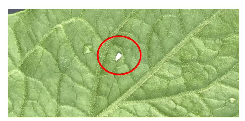
Fig 2. Population of B. tabaci

Based on the results of observations on the tomato planting area in Kedisan Village, Kintamani District, it was found that the average number of nymphs in each sample plant at the age of 14 (DAP) was 0.37 nymphs and imago per plant. There was an increase in the average number of the dominant population increased at 42 (DAP) to 1.13 nymphs and imago/plants. Observation